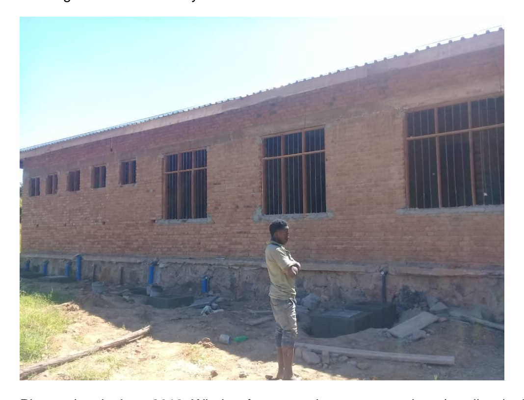
Photo taken in June 2018: Window frames and waste water pipes (two lines) with cleaning boxes