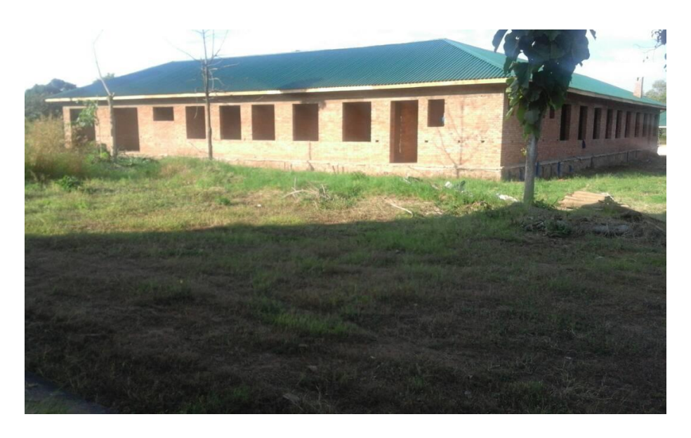
Building Photo taken in May 2018