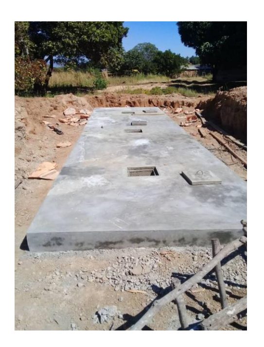
Waste water handling with a three-chamber system (under construction and ready)